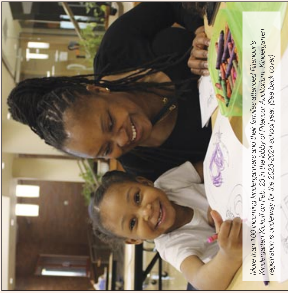
More than 100 incoming kindergartners and their families attended Ritenour's Kindergarten Kickoff on Feb. 23 in the lobby of Ritenour Auditorium. Kindergarten registration is underway for the 2023-2024 school year. (See back cover)