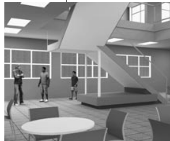
The new cafeteria upgrades at Ritenour High School are scheduled to be completed in August of 2023.